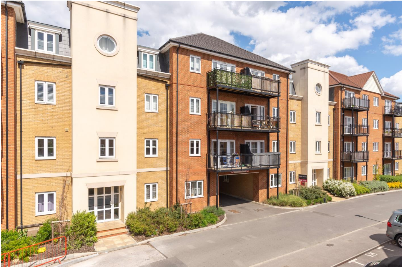
Alderson Grove, Walton-On-Thames, KT12 5EG